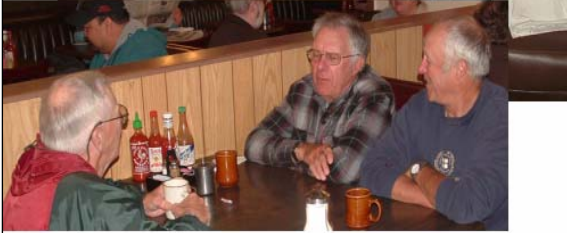
Breakfast at South Shore Cafe, Alameda