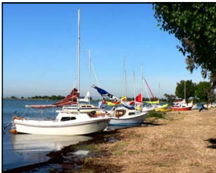
Woodward beach